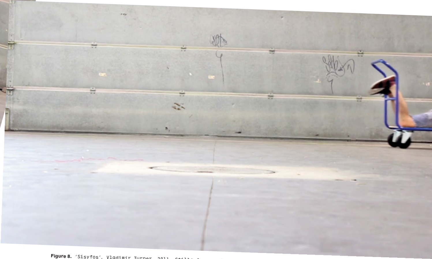
Figure 8. 'Sisyfos', Vladimir Turner, 2011. Stills from a video ©Vladimir Turner.