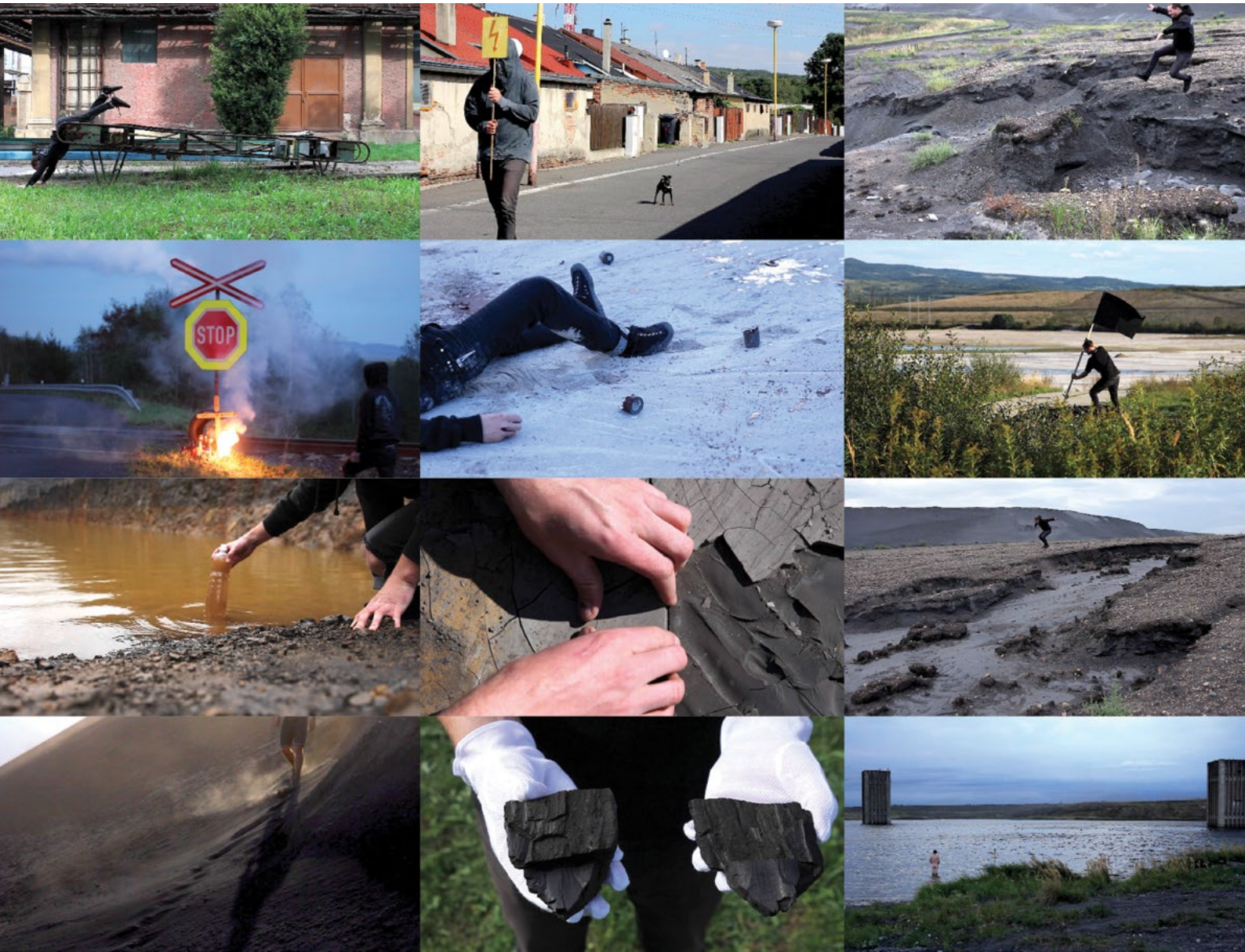
Figure 10. 'Funeral', Vladimír Turner. The Ore Mountains, Czech-German border, 2016. Stills from a video ©Vladimír Turner.

Finally, 'Ghost Car' was a nocturnal stroll in which David Renault used a car lighting system to simulate the ghostly presence of a stationary car. Parked in a number of unlikely urban niches or on the side of the road for two evenings, the Ghost Car generated a fleeting and silent ghostly presence, like a disquieting mechanical sentry. Bringing together these three strands, Genius Loci takes a contemplative, melancholy look at Saint-Brieuc, a dormitory town haunted by its industrial and seaport past in decline.