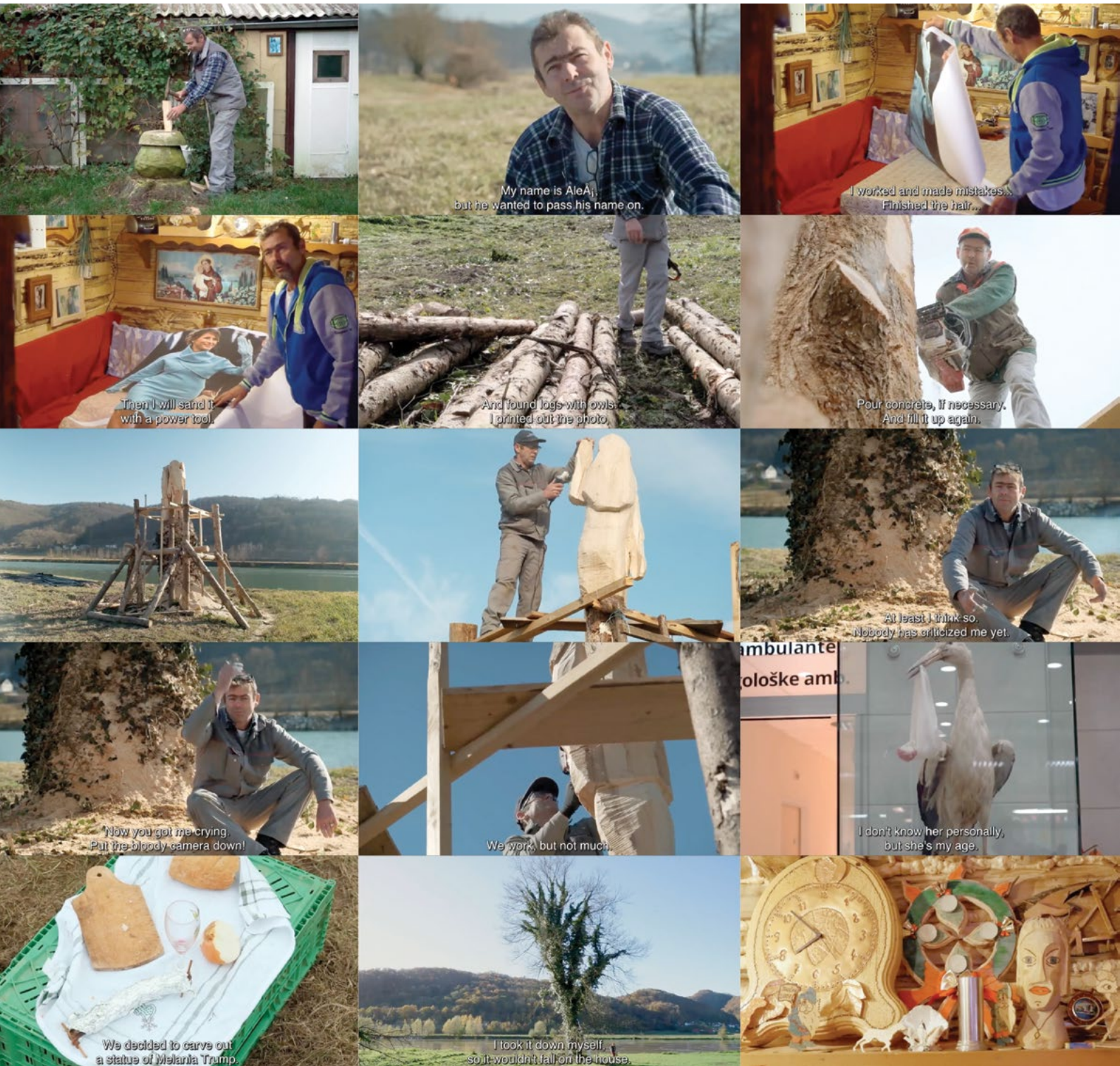
Figure 11. 'Melania' (first part), Brad Downey. Melania, Rožno, Slovenia, 2019. Stills from a video ©Brad Downey.