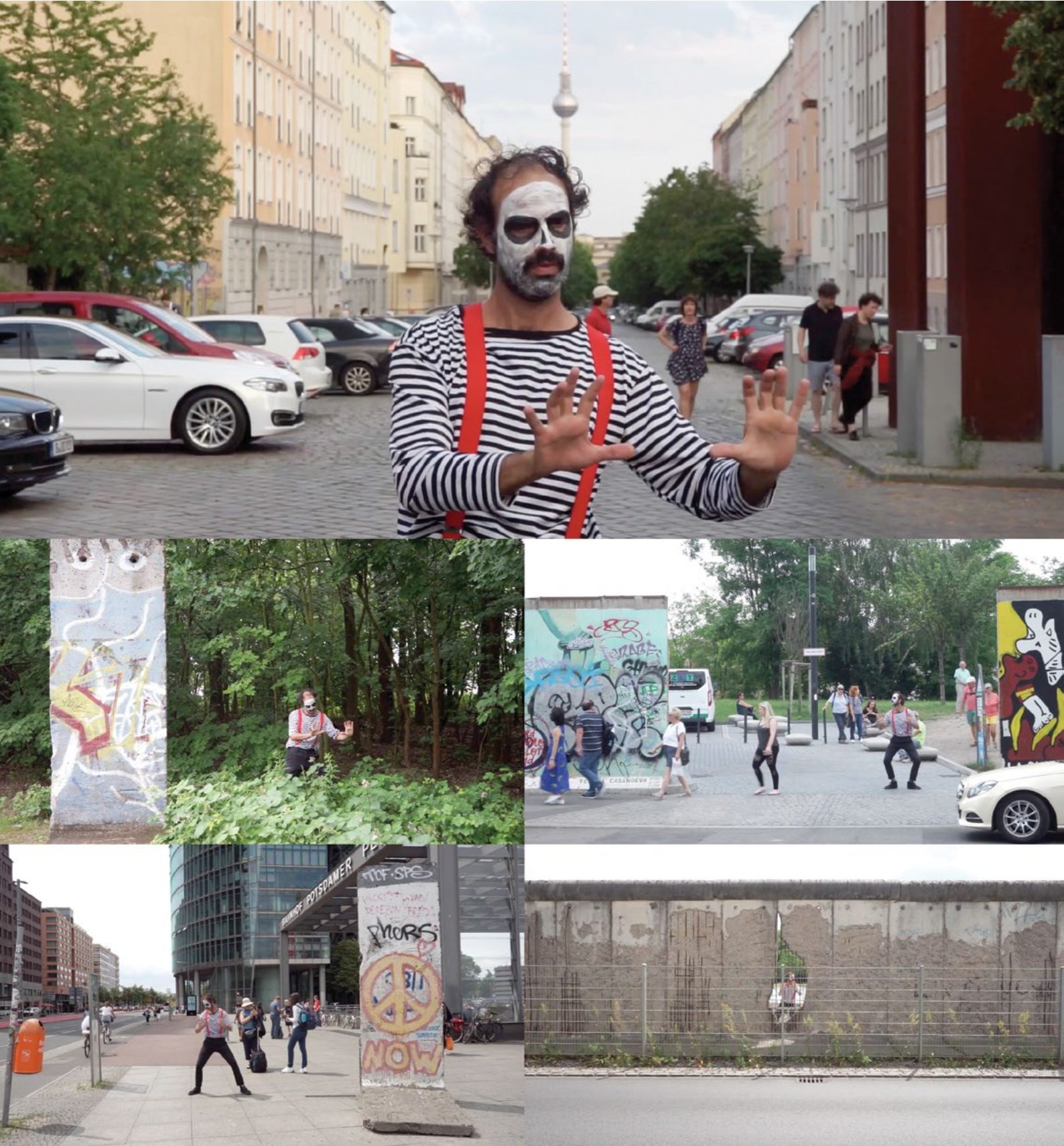
Figure 2. 'The Ground Walks With Time in a Box', Brad Downey. Berlin, Germany, 2019. Stills from a video ©Brad Downey.

air and pretending to scan its surface for a breach. The pair cross the city centre to the very edge of the line's materialisation on the ground, until it disappears beneath the new buildings – the same buildings climbed by Wermke and Leinkauf.