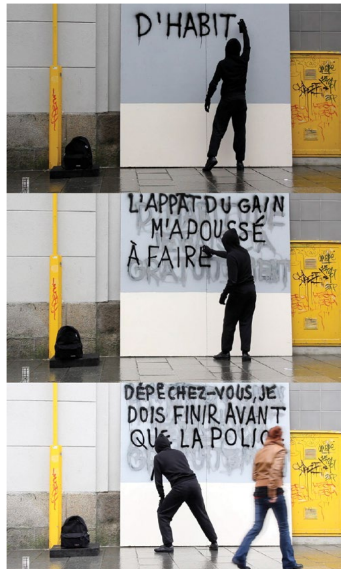
Figure 3. 'Graffiti Statue', Mathieu Tremblin. Quimper, France, 2012. Stills from a video ©Mathieu Tremblin.

In contrast, the video by American artist Downey is in the tradition of performance recordings. It consists of a long video capturing – on either side of the old line drawn by the wall – the same person crossing the space with a slow, confident gesture that lends a certain anachronistic burlesque to the situation.