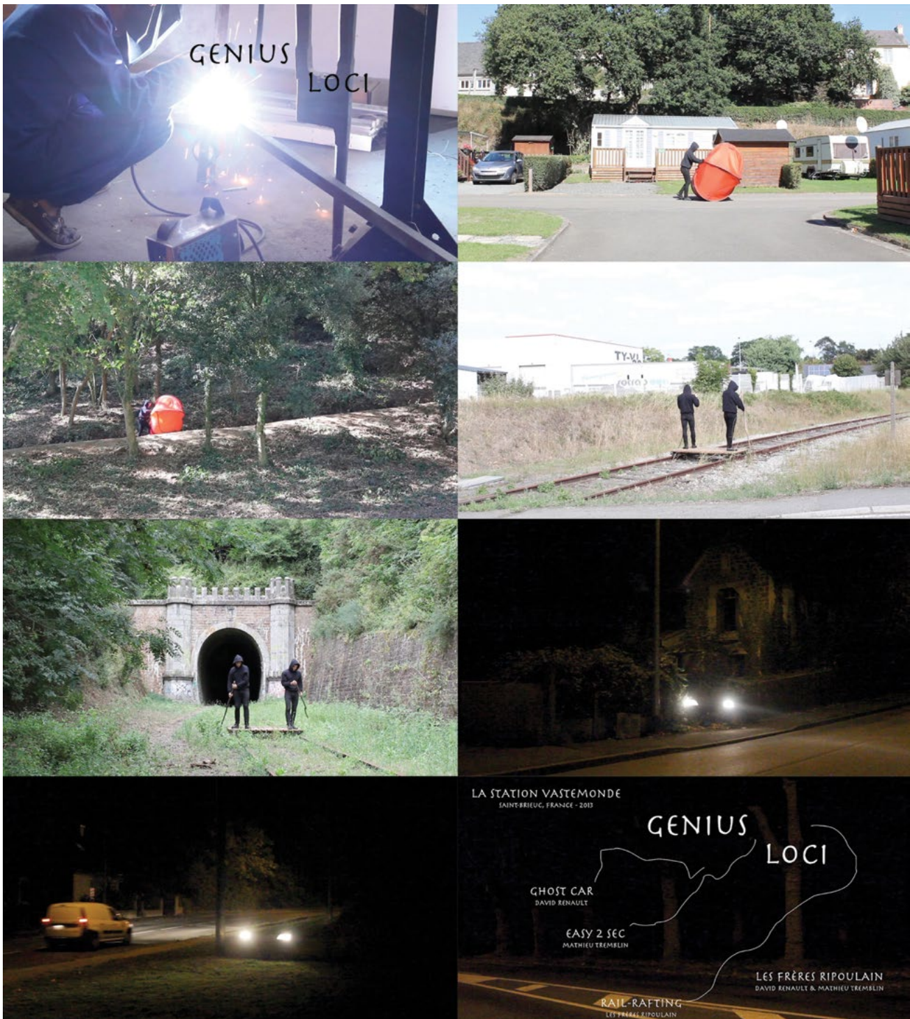
Figure 9. 'Genius Loci', David Renault and Mathieu Tremblin (Les Frères Ripoulain), Saint-Brieuc, France, 2013. Stills from a video ©Mathieu Tremblin.

'Easy 2 Sec' is a symbolic transposition of the myth of Sisyphus into a suburban environment. Over the course of a day, I crossed the four kilometres of valley in the heart of Saint-Brieuc – between Les Vallées campsite and the harbour in Le Légué – pushing ahead of me an ovoid structure on a human scale. This sphere was constructed from single-person folding tents, built one inside the other. This action re-enacts, in the field of consumer society, the punishment of Sisyphus, condemned for having dared to defy the gods by eternally rolling a boulder up a hill and rolling it back down again each time before reaching the top. This action, repeated twice, appears as an allegory of the condition of the nomad in the city – whether tourist or homeless.