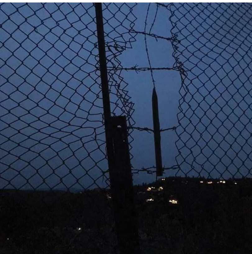
Figure 9. Asheville, North Carolina, USA 2021.