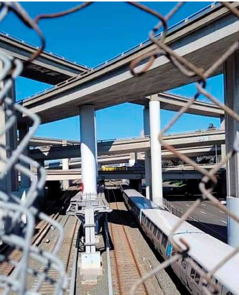
Figure 3. 2021.