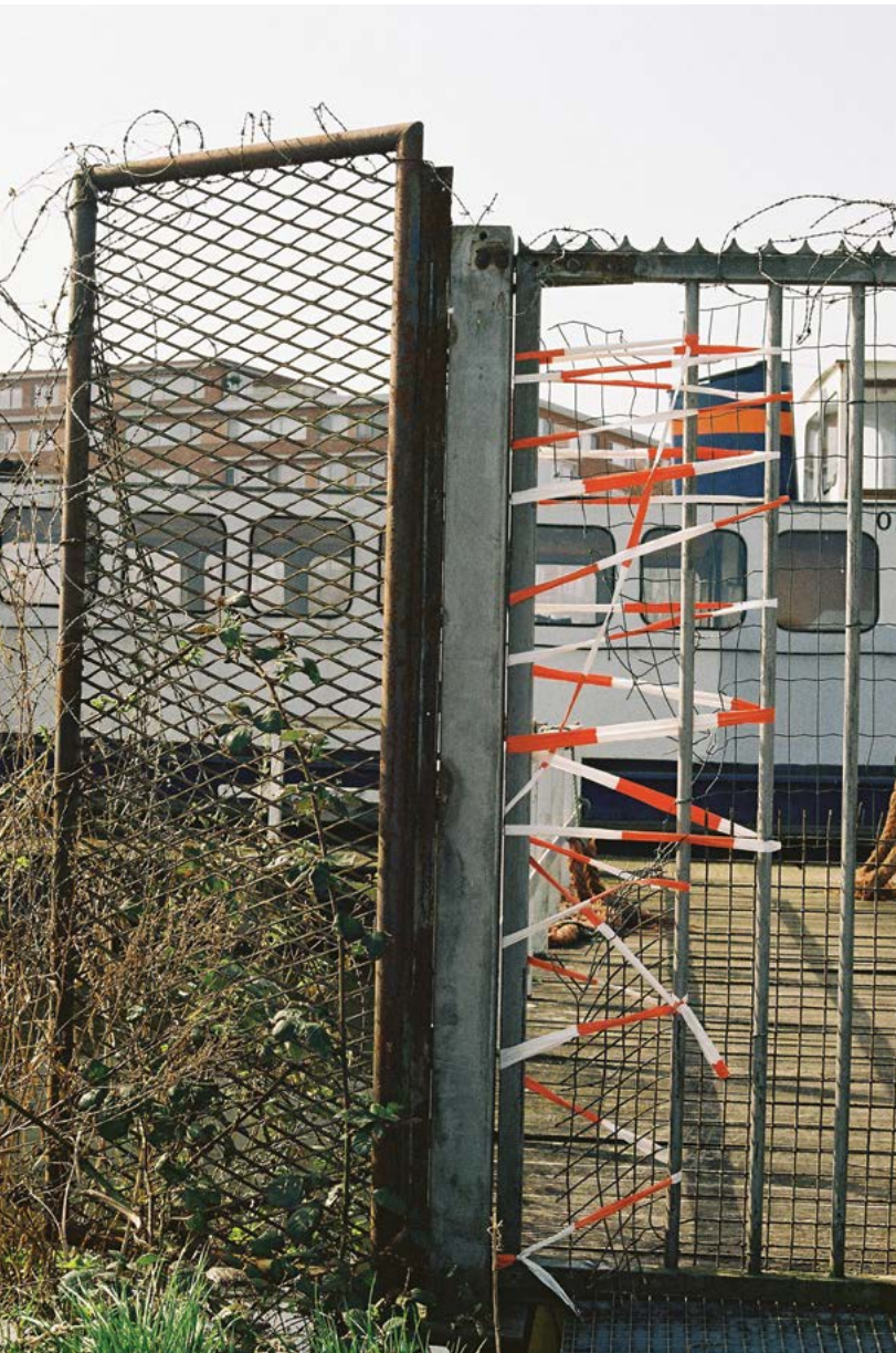
Figure 11. NYC, New York, USA, 2023.