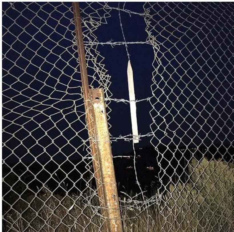
Figure 7. Park City, Utah, USA, 2021.