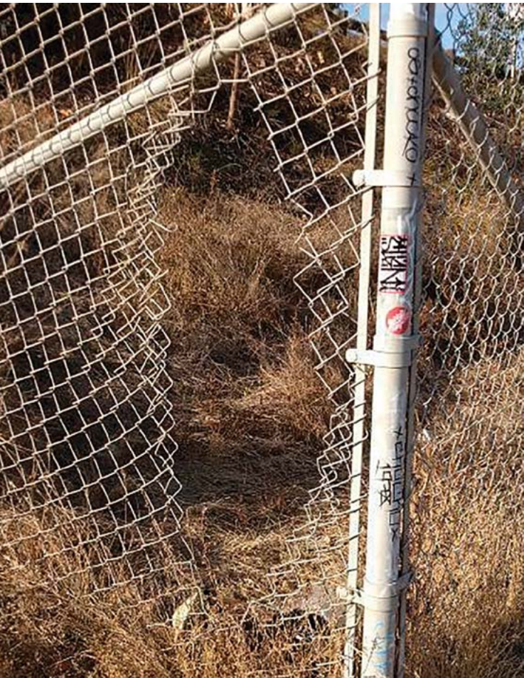
Figure 6. San Diego, California, USA, 2021.