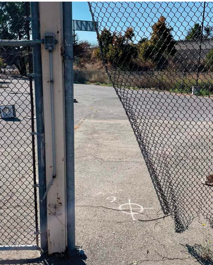
Figure 12. Nashville, Tennessee, USA, 2022. Photograph @bikespokecypher.